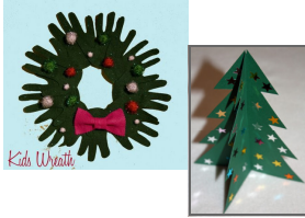
Holiday Ornaments (McGrath)

On Tuesday, December 20th, we will have our Open House with many activities from 5:30 - 7:00. The choir will also be singing carols for us that evening. At 7:00, the reading of "T'was the Night Before Christmas" story will take place before we close for the night. Please make sure to come and enjoy a fun family night. Our activities for December 20th are as follows: