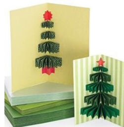
Tree Cards (Halabecki)