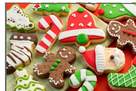
Decorate Christmas Cookies (Herron)