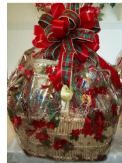
Christmas Basket Raffle