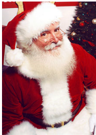
Visit from Santa