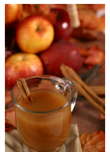
Apple Cider Station (School Council)