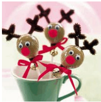
Reindeers (Genge, Coulis)