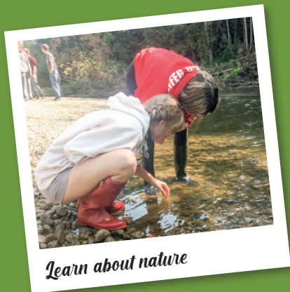
Learn about nature