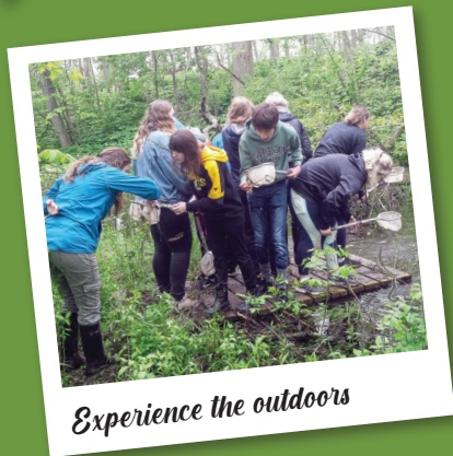
Experience the outdoors