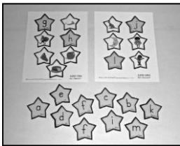
Super Stars Part

Strong Start Charitable Organization has been developing the Letters, Sounds and Words program for over ten years. This program is special because it has been created to be used specifically by volunteers who do not need to have experience in a related field. The program is funded through donations from the community. You can learn more about Strong Start at www.strongstart.ca . Thank you for your interest.