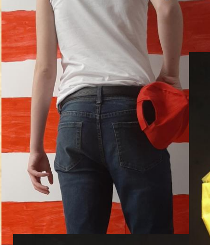
Born in the USA / Bruce Springsteen

Below are some examples of the album covers that students recently completed.