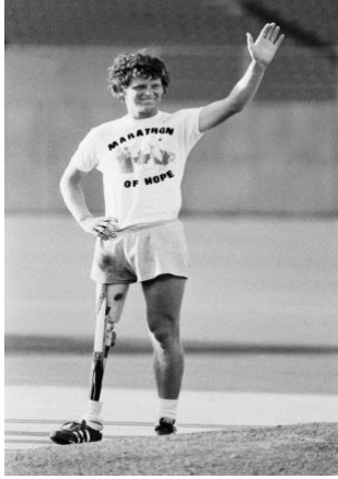
TERRY FOX RUN September 29 th , 2022