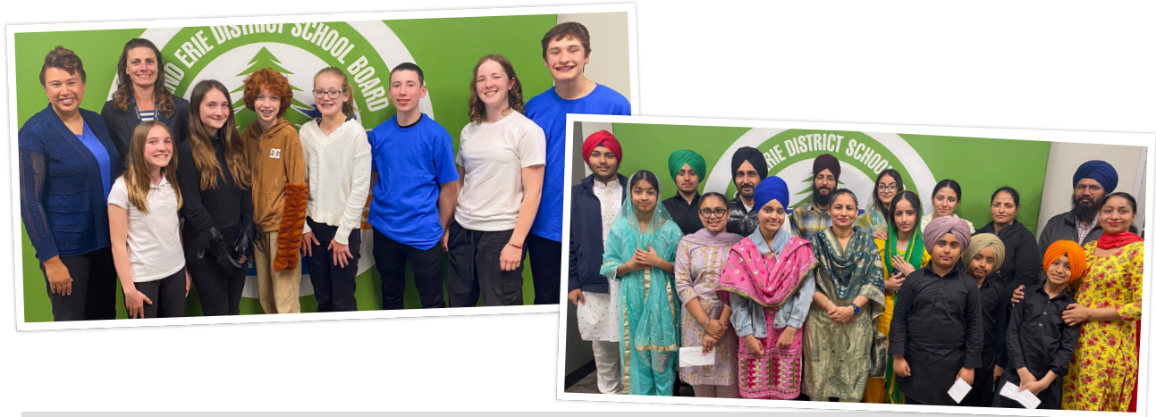
Above: Learners and educators from James Hillier Public School and the Punjabi language program each presented as part of the student showcase.

All reports for this meeting can be found here .